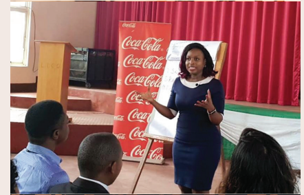
Coca-Cola Africa, a leading DBC sponsor, leading a workshop on "Winning Interview Strategies"