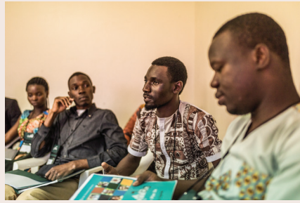
Workshops allowed for scholars to work and share in smaller groups