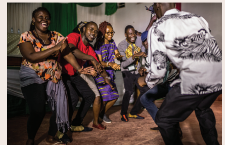
Scholars during the evening festivities