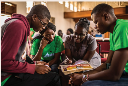
Kenyan fellows during fellowship workshops