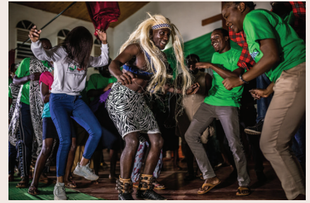
The Rwandan scholars performing evening entertainment