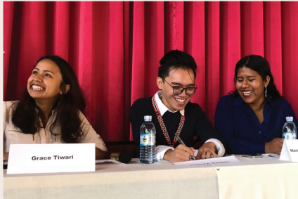
Scholar panel on community service projects