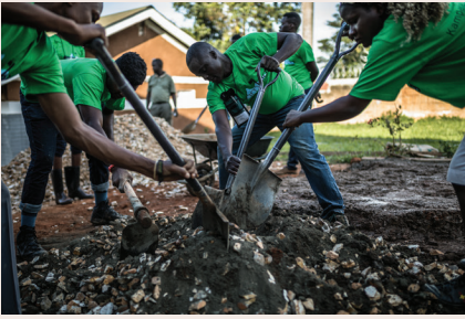
Building a ramp to increase accessibility at EmbraceKulture during group community service