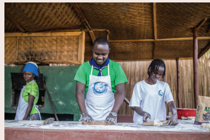
Scholars making pizza for Malayaka House youth during group community service